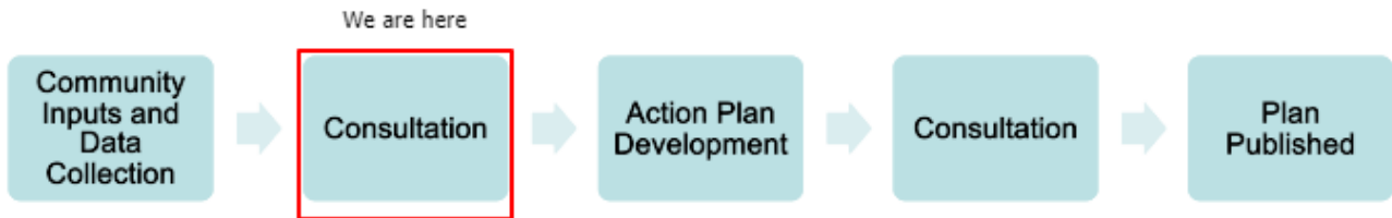
Figure 1 – Area Transport Plan Process Diagram

The Cowdenbeath Area Transport Plan is being developed by Roads and Transportation Services working alongside local communities. The purpose of the Plan is to consult on and agree local transport objectives and to develop an Action Plan for improving movement and connectivity in the local area. Local area transport plans are published at the end of the process – see process diagram.