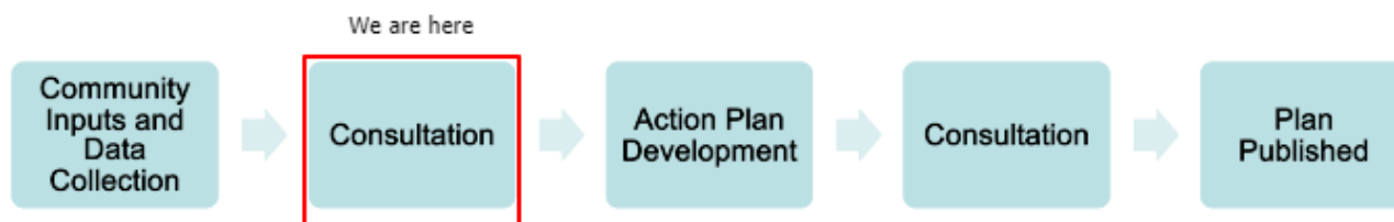
Figure 1 – Area Transport Plan Process Diagram

The Kirkcaldy Area Transport Plan is being developed by Roads and Transportation Services working alongside local communities and work on Kirkcaldy town centre. The purpose of the Plan is to consult on and agree local transport objectives and to develop an Action Plan for improving movement and connectivity across the local area, including all places from Burntisland to Dysart. Local area transport plans are published at the end of the process – see process diagram.